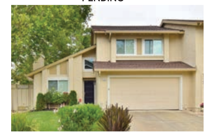
2355 Lake Meadow 3 Bed | 2 Bath | 1,686 +/- Sq. Ft.