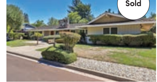
343 Fernwood Drive, Moraga Offered at $1,885,000 Represented Buyer

1 El Caminito, Orinda Offered at $2,875,000 Represented Buyer